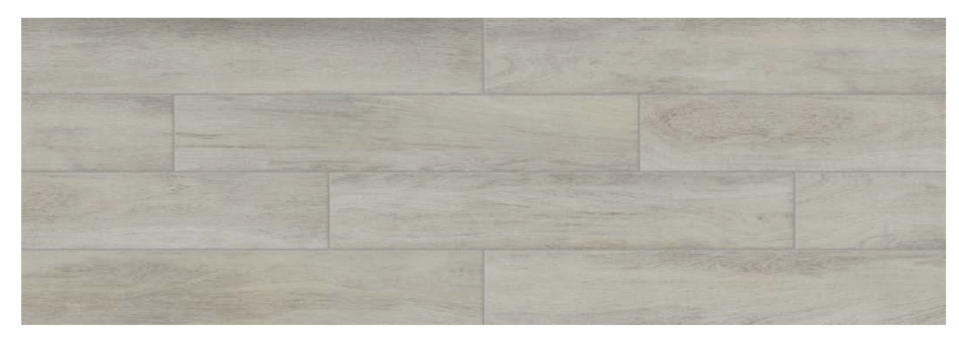
GRIGIO 6"x36" - 1103866