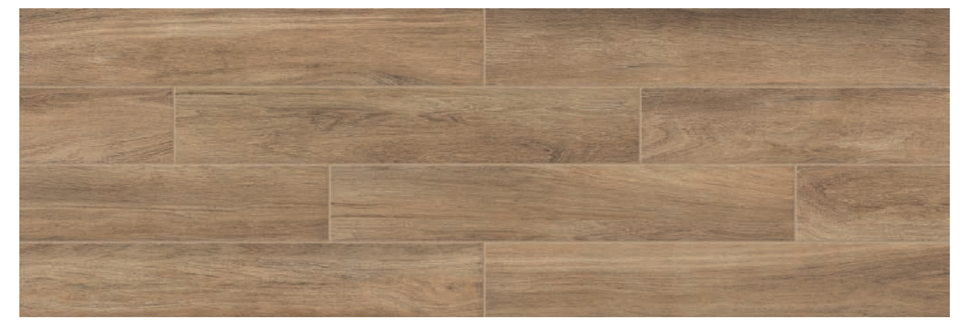
LARICE 6"x36" - 1103826