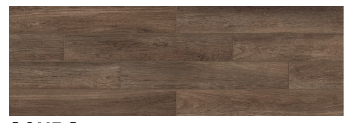
SCURO 6"x36" - 1103868